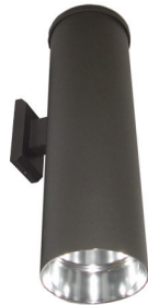
Mini cast aluminum wall mount option for 8" diameter electronic metal halide bal- last only.