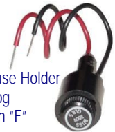
Fuse and Fuse Holder Suffix Catalog Number With "F"