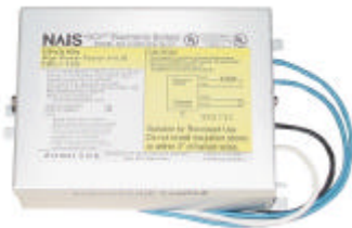
Electronic metal halide ballast option. Suffix catalog number with "E". Metal halide 8" dia. only.