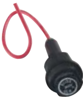
Fuse & Fuse Holder: Suffix catalog # with F