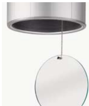
Protective tempered clear glass shield for restricted lamps

Powder Coat Paint Finish: Available in textured black, textured bronze and sky white. Custom colors (RAL) are also available, contact factory to inquire.