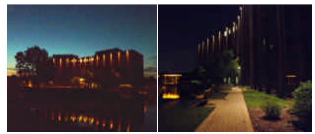
Installation with PAR30LN