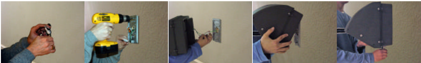
STEP 1. Connect quick connector to power supply.

Cast aluminum mounting bracket factory installed. Universal cast aluminum gasketed junction box mounting bracket supports fixture and mounts to junction box. Fixture supplied with quick disconnect wiring harness for supply wire to fixture connection.