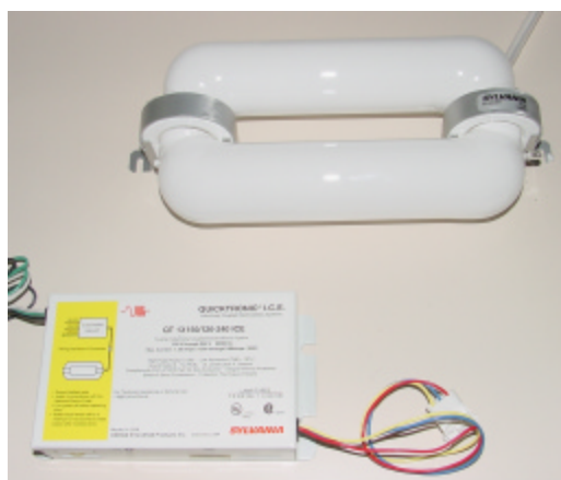
ICETRON® Lamp & Ballast System