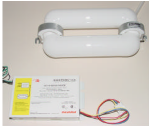
ICETRON® Lamp & Ballast System

*Includes an internally mounted AC axial fan with die-cast aluminum housing, and thermoplastic impeller. Two 1" louvered aluminum vent plugs for maximum heat dissipation.