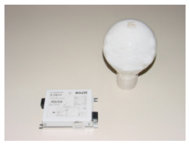
PHILIPS QL INDUCTION LAMP AND HIGH FREQUENCY ELECTRONIC BALLAST SYSTEM