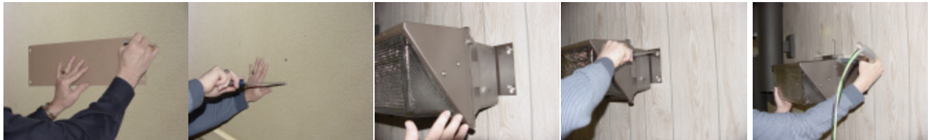
STEP 1. Mark wall with supplied template. STEP 2. Start fasteners in wall. STEP 3. Hang wall pack using keyhole slots. STEP 4. Secure to wall. STEP 5. Connect wall pack external j-box.

Surface Power Supply Installation: Factory installed 12 gauge steel wall mounting brackets with 4 keyhole slots, finished the same as the housing. Cardboard template for locating the mounting brackets. Factory installed junction splice box, tapped for either 1/2" or 3/4" (must specify) liquid-tight connector suitable for wet location.