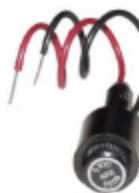
Fuse and Fuse Holder Add suffix "F" to order number.