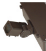
Adjustable slip fitter. Suffix catalog number with SAB .