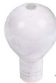
Fulham High Horse