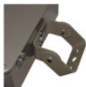
Adjustable yoke mount. Suffix catalog number with YAB .