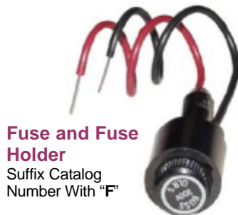
Fuse and Fuse Holder Suffix Catalog Number With "F"