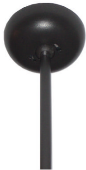
Pendant mount Suffix catalog number with P2xx. xx= stem length in inches.