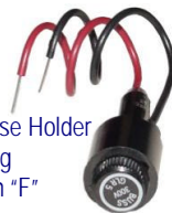
Fuse and Fuse Holder Suffix Catalog Number With "F"