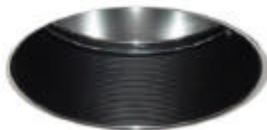
Mini-groove black baffle option.