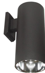
Cast aluminum wall mount. Change S in catalog number to W.