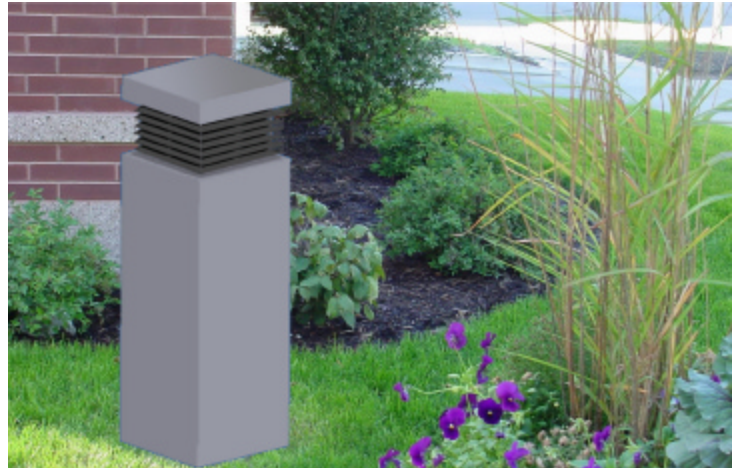
NOTE: The "Greystone" with flat top style cap is 39" high. All other concrete bollards have peaked cap styles and are 40" high.

SPECIFICATIONS SUBJECT TO CHANGE WITHOUT NOTICE