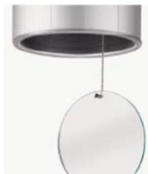
Protective tempered clear glass shield for restricted lamps

Powder Coat Paint Finish: Available in textured black, textured bronze and sky white. Custom colors (RAL) are also available, contact factory to inquire.