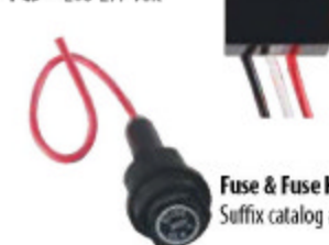
Fuse & Fuse Holder: Suffix catalog # with F